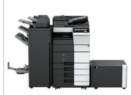
Configuration with SF-537SD Finisher, PI-507 Post-Inserter, RU-513 Connection Unit, PC-215 Drawers, LU-207 Side Drawer